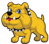
Grant Wood Elementary