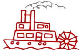
Mark Twain Elementary