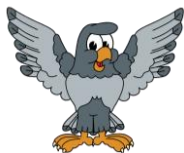
Herbert Hoover Elementary