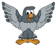
Herbert Hoover Elementary