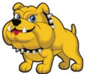
Grant Wood Elementary