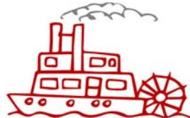
Mark Twain Elementary